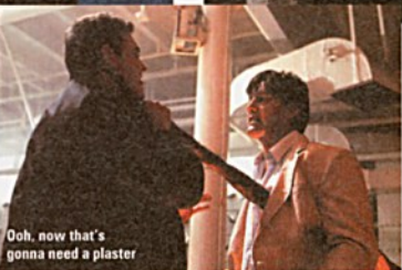
Ooh, now that's gonna need a plaster

how my character feels about him. Basically, Telemachus sees him as the lowest form of life in the universe. Tyr tried to pass himself off as the reincarnation of the greatest Nietzschean to ever live [Drago Museveni], and that didn't sit well with Telemachus.