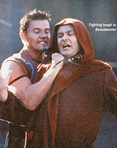
Fighting tough in Beastmaster